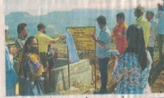
डंबवाडी (ता. आंबेगाव) जलशुद्धीकरण प्रकल्पाचे उद्घाटन करताना मान्यवर.

त्यानुसार संस्थेच्या कार्यकर्त्यांनी गावांचा सर्व्हे केला. तसेच भूगर्भ शस्त्रशमार्फत तळ्यांचा देखील सर्व्हे करण्यात आला. त्यानंतर तळ्यातील पाण्याची प्रयोगशाळेत तपासणी करण्यात आली. ज्या